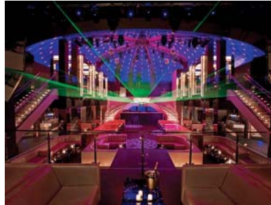
DSim on Hare

The primary moving light fixture used was Elations Design Spot 575E. "Just this past year I've started using Elation fixtures," says Lieberman. "They've really stepped up their quality of manufacturing on this particular series of fixtures and they're now using dichroic glass reflectors, so the output's really clean. They're just